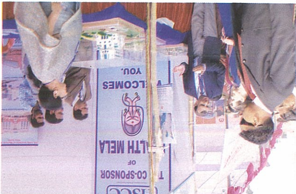
Smt. Sonia Gandhi, UPA Chairperson, visited HSCC stall at Health Mela at Raebareilly on 4 th & 5 th Feb. 2011