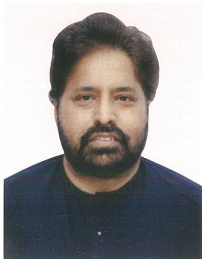
SHRI SUDIP BANDYOPADHYAY Hon'ble Minister of State for Health & Family Welfare