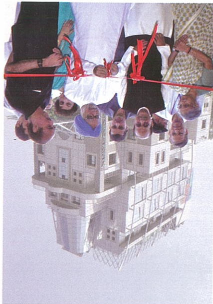
Inauguration of Sports Injury Centre, Safdarjung Hospital, New Delhi by Dr. Mannohan Singh, Hon'ble Prime Minister of India on 26.09.2010